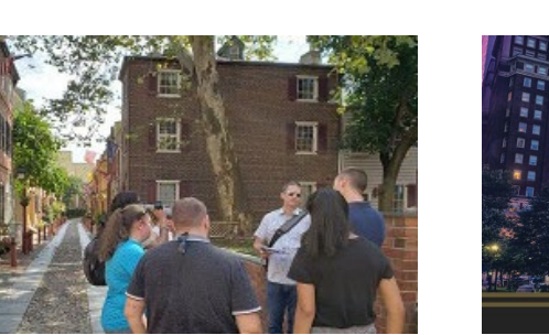
History of Public Health Walking Tours Sun., November 3 – Wed., November 6 3:30 – 5:30 pm Pennsylvania Convention Center 1101 Arch Street