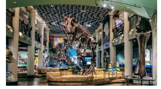
Dornsife School of Public Health Dean's Reception Mon., November 4 6:00 – 9:00 pm The Academy of Natural Sciences of Drexel University